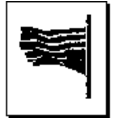
Nation in Distress