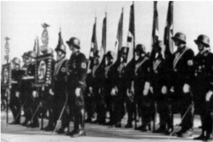
Nuremberg, Germany, September, 1937

At least he's taking it seriously. —editor