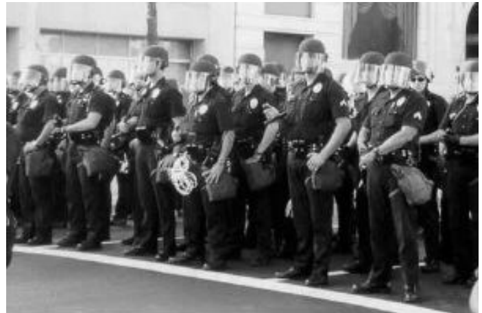
Los Angeles, California, August, 2000 Original Source Unknown