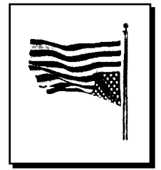
Nation in Distress

The fact that a man is ignorant, or even stupid, doesn't give someone else the right to make his decisions for him.