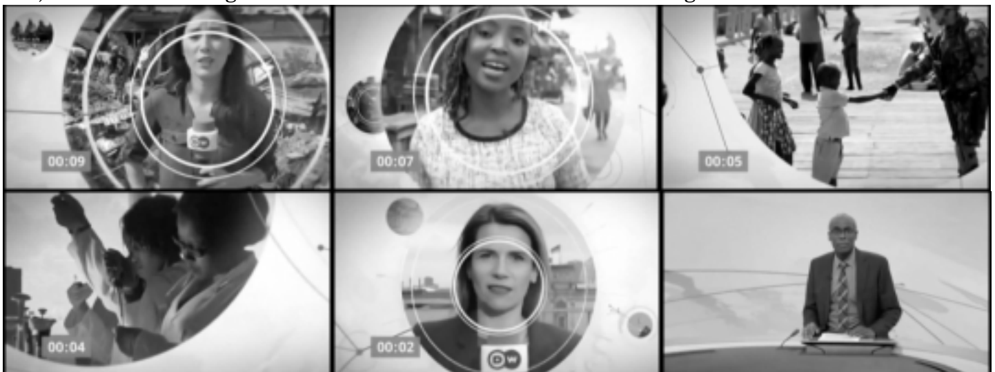
Pictures Taken from the Opening Sequence of DW News , Friday, April 23, 2021

While I was writing this article, I noticed an even better example of white male exclusion. It's an advertisement for Worldchannel.org . It's even more misandrist than the DW News video clip, and far more politically correct. I'd already put the DW News pictures in the article, so I put the Worldchannel.org video clip in the videos section of The Frontiersman Website , under the heading Worldchannel . 🦅