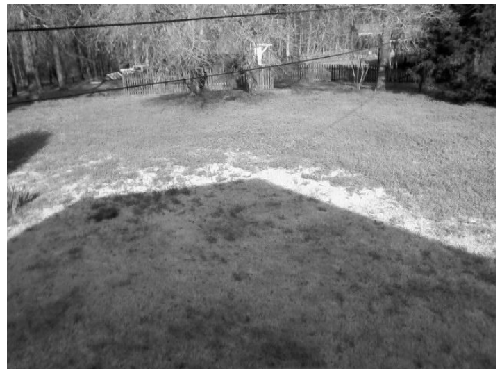
March 20, 2010