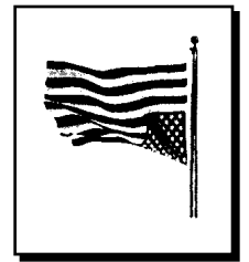
Nation in Distress

Pardon him Theodotus: he is a barbarian and thinks that the customs of his tribe and island are the laws of nature.