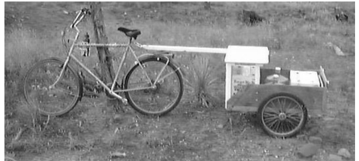
Crazy Horse and the Trailer

While I lived at Mere Keep, most of what I needed was nearby, so I did most of my traveling on Crazy Horse, or on foot. I had a trailer that I pulled behind Crazy Horse, for things that wouldn't fit into a backpack. One day, I was at