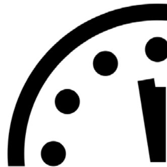
The Doomsday Clock