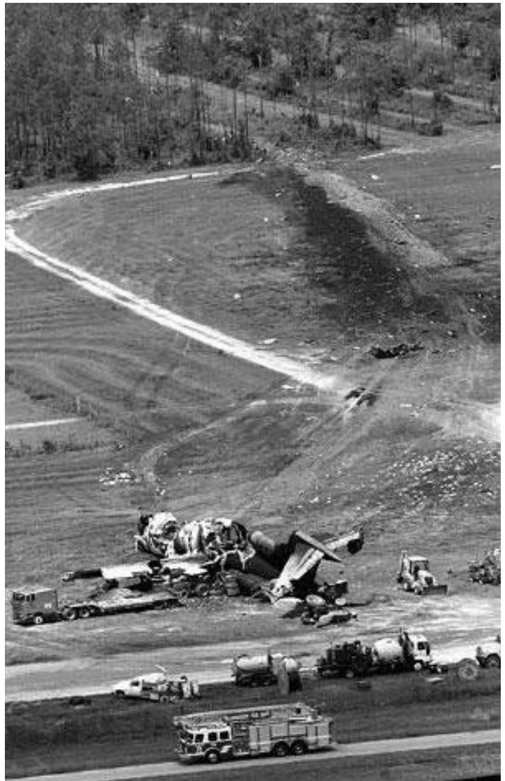
—Federal Express Flight 1478 from AirDisaster.Com

crew received clearance from Jacksonville Center for a visual approach to runway 9 at 5:36am. The first impact mark was on a tree, about 70 feet high and 3,100 feet from the end of the runway. The plane first hit the ground about 2,100 feet from the end of the runway, and the first piece of wreckage - a leading edge flap - was found approximately 200 feet from the initial tree-strike point. The aircraft's landing gear was down at the time of the accident. The 727 skidded to a stop about 1,000 feet from the end of the runway and caught fire; the flight crew escaped major injury. —from AirDisaster.Com