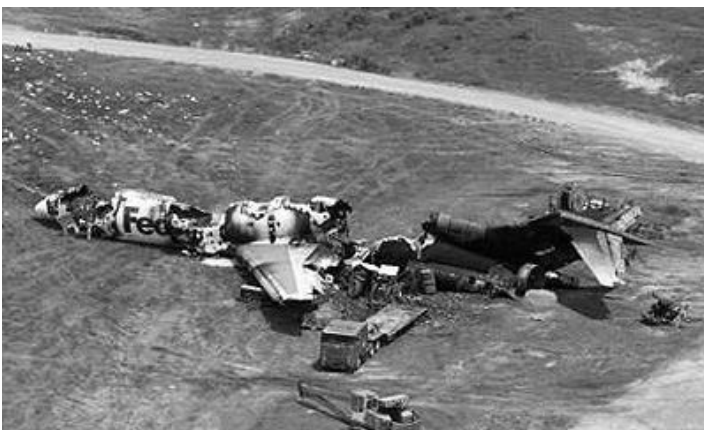
—Federal Express Flight 1478